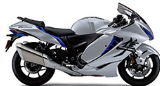
Metallic Mystic Silver / Pearl Vigor Blue (ASU)