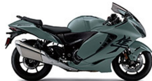
Metallic Mat Steel Green / Glass Sparkle Black (C0T)