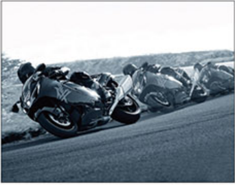
Suzuki Intelligent Ride System (S.I.R.S.)

Developed for the Hayabusa, the unique and strong RK GB50GSVZ4 drive chain has larger pins and rollers for reliable and quiet operation.