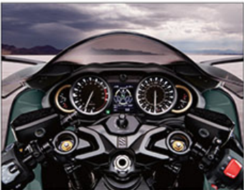
The beauty of fine instrumentation