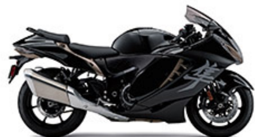
Glass Sparkle Black / Metallic Mat Titanium Silver (BLG)