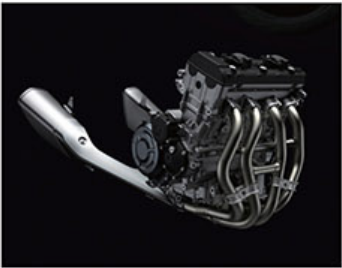
1,340cm 3 liquid-cooled inline-four engine