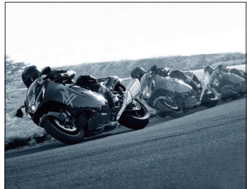
Suzuki Intelligent Ride System (S.I.R.S.)

The powerful 1,340cm 3 liquid-cooled, inline-four-cylinder, DOHC