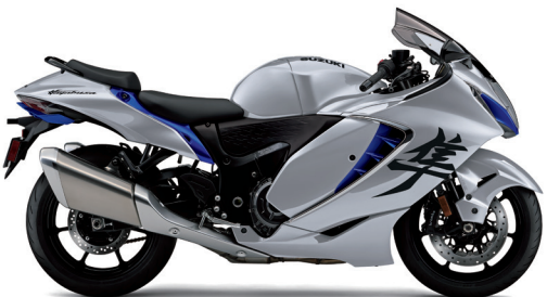
Metallic Mystic Silver / Pearl Vigor Blue (ASU)