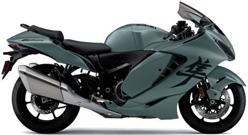
Metallic Mat Steel Green / Glass Sparkle Black (COT)