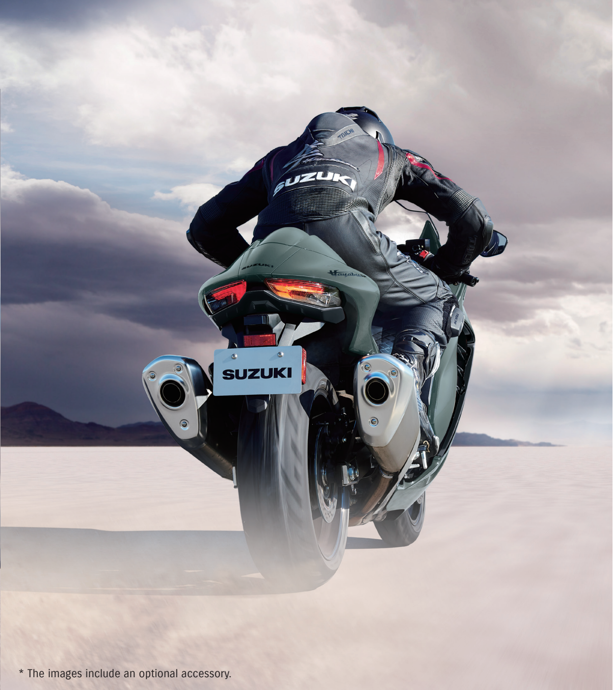
* The images include an optional accessory.