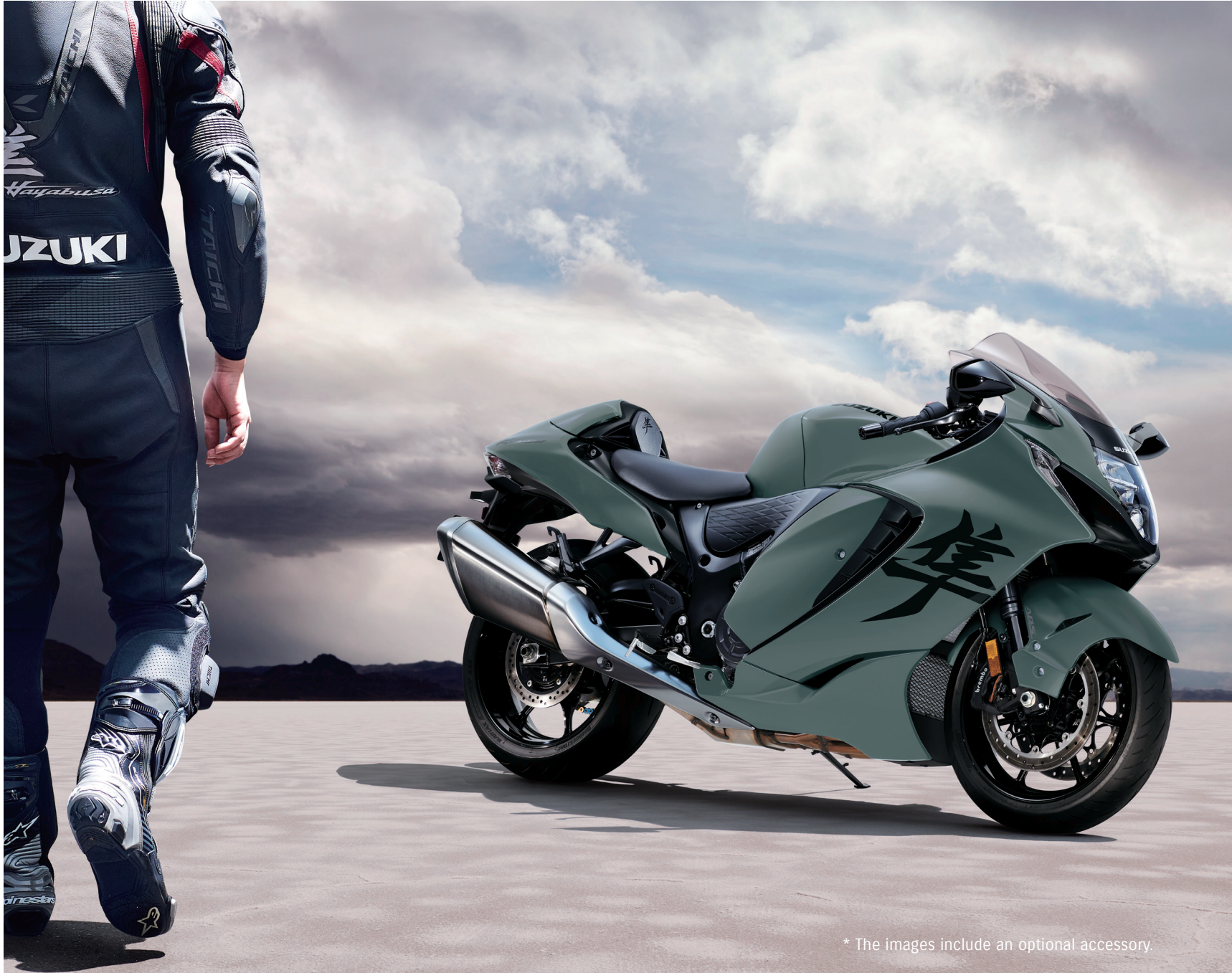
* The images include an optional accessory.

Billet brake and clutch levers, a stylized and strong aluminum chain adjuster block and front axle sliders blend a look of performance and real function.