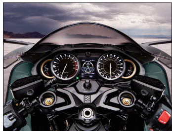
The beauty of fine instrumentation

engine has been fully revised to supply a seamless surge of torque for effortless acceleration.