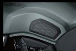
Tank Side Protection