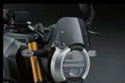
Meter Visor (Smoked Tint)*1

We've put together a collection of accessories, each thoughtfully designed for quality, usability, and style, to help you customize and personalize your ride. With a variety of options built to boost comfort, practicality, and protection, you can choose the items that express your unique style.