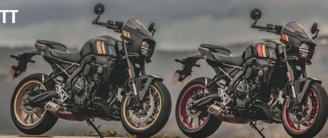
Pearl Mat Shadow Green (QU5)