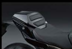
Single Seat Cowl