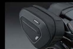
Soft Side Case Set*2

*1 Available on the GSX-8T. *2 Soft Side Case Bracket Set is required for installation.