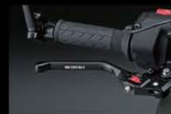
Billet Brake Lever