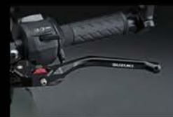
Billet Clutch Lever