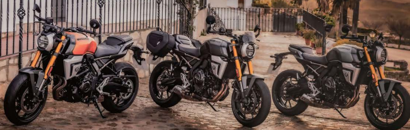
Candy Burnt Gold (QSY)