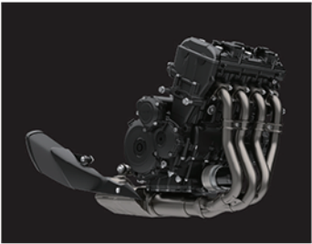
Stellar Engine Performance