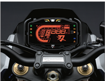
Multi-function Instrument Cluster