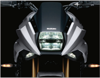
Highly Functional and Attractive Lighting

Suzuki Drive Mode Selector (SDMS) offers a selection of three different output maps that match performance to riding conditions, surface conditions, or preferred riding style.