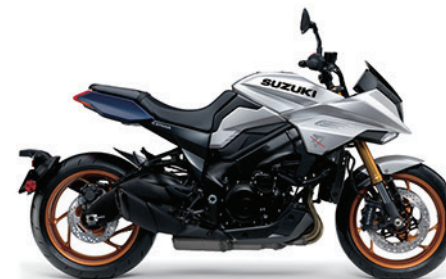
Metallic Mystic Silver (YMD)