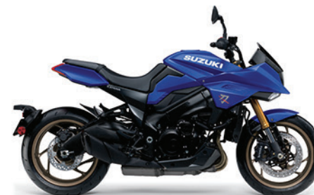
Pearl Vigor Blue (YKY)