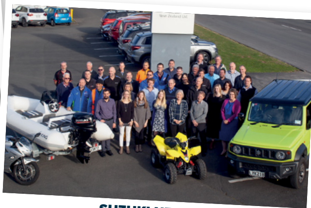
SUZUKI NZ 2020