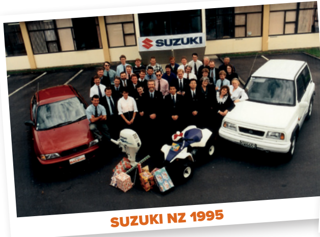
SUZUKI NZ 1995