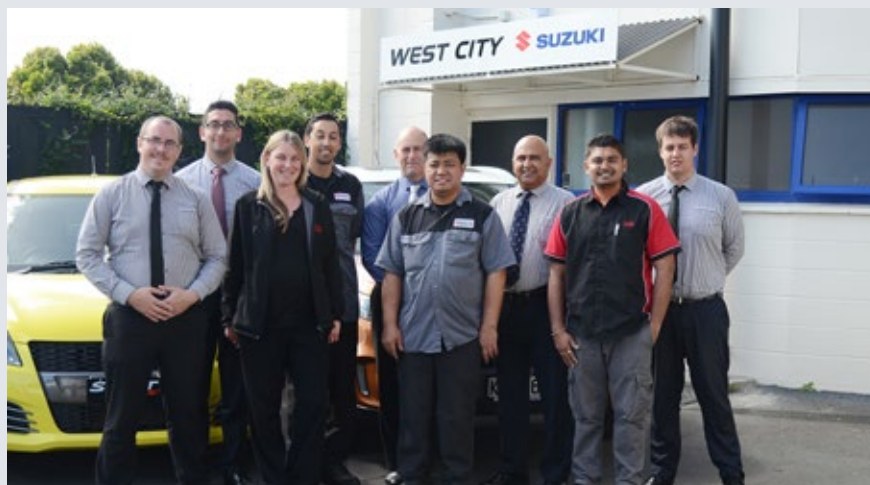
The busy team at West City Suzuki, Henderson, Auckland.

"It's great having the latest vehicles on the yard, and we can't wait to get our new facility up and running."